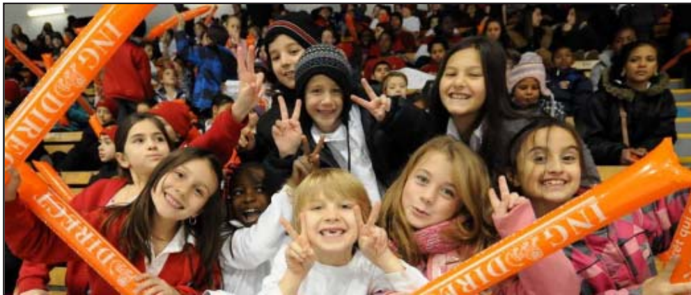
A capacity crowd was on hand for McGill's "Score With School" game against RMC

years, three of them due to injury in his sophomore campaign and three more last season, when he was overseas playing for Canada at the world university games in Turkey.